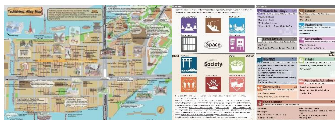
Figure.3 Main achievements of Tsukishima Nagaya School